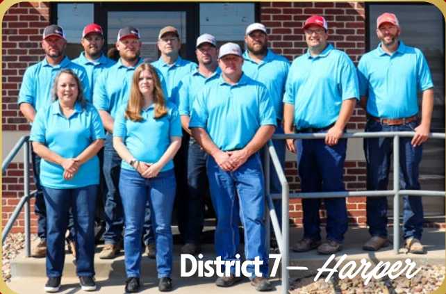
District 7 — Harper