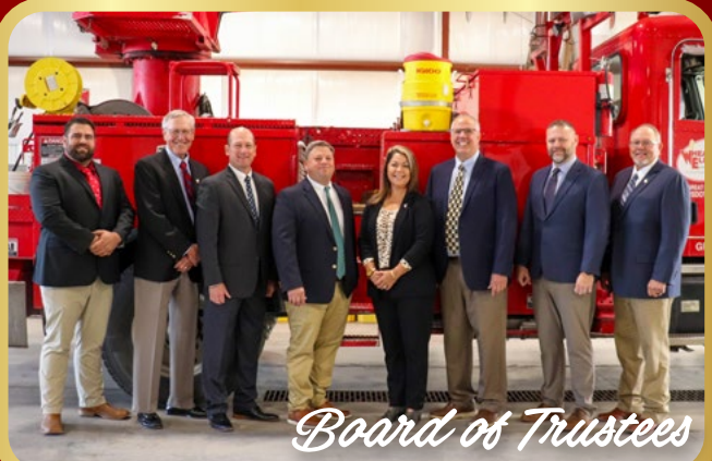
Board of Trustees