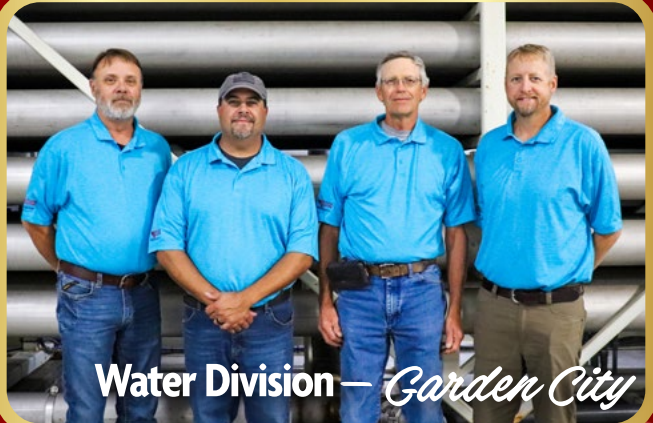
Water Division — Garden City