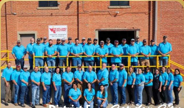
District 5 — Garden City

All WEC offices will be closed for the holidays on Dec. 24, Dec. 25, and Jan. 1.