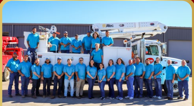
District 6 — Great Bend