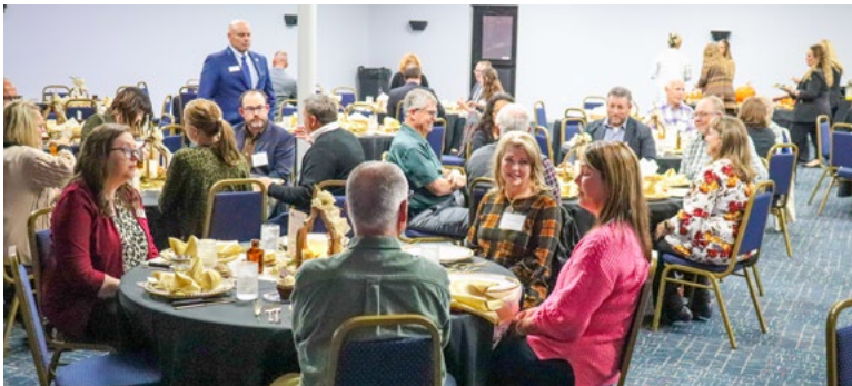
About 40 members attended the member engagement meeting in Scott City, held at the Western Kansas Child Advocacy Center.

Member engagement meetings are held annually on an invitation-only basis. These interactions allow members to voice their thoughts and concerns directly with cooperative staff and trustees, strengthening our connections with the communities we serve. Meeting locations rotate from our west to our east districts. For more information or questions, contact memberservices@weci.net .