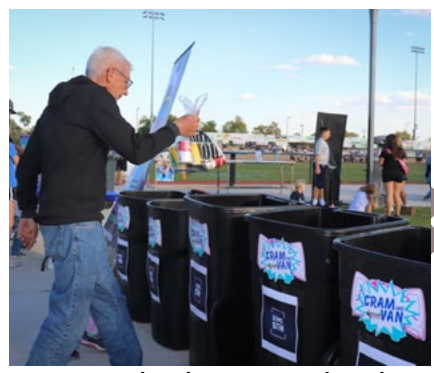
A co-op member donates canned goods at a 2022 Cram the Van event during a Scott City Middle School game. Cram the Van is a cooperative-wide effort, and all cash and can donations are donated to the food banks in the same communities that the donations are made.