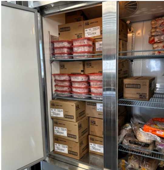
ABOVE: Eight food banks across southwest and central Kansas received several hundred pounds of honey ham deli meat from Tyson Fresh Meats to stock freezers ahead of the holidays.