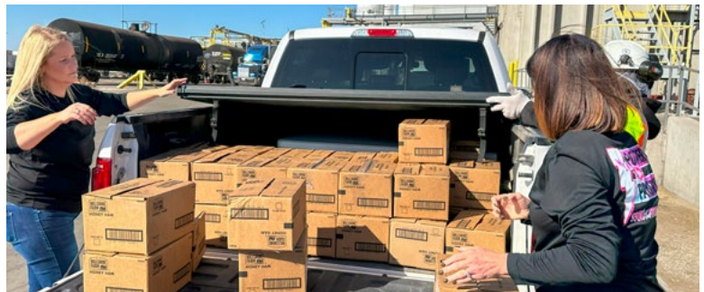
RIGHT MIDDLE: Member services employees distribute the boxes of honey ham for delivery on Oct. 2 at the Tyson plant in Holcomb.