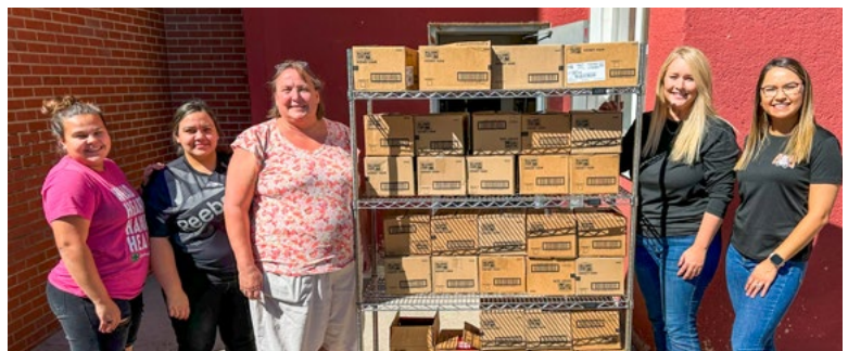
RIGHT BOTTOM: Volunteers at the Hamilton County Food Bank receive honey ham to stock their freezers on Oct. 2.