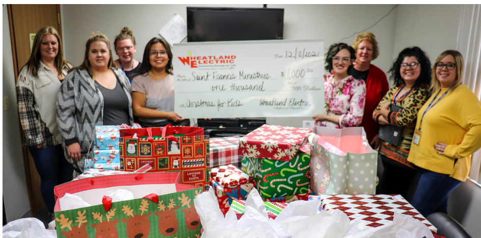
Saint Francis Ministries accepts a $1,000 Sharing Success grant and receives wrapped Christmas gifts for 99 children sponsored by Wheatland Electric trustees and employees.

This is the fifth consecutive year (since 2017) that we've