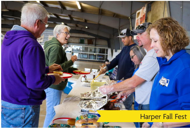
Harper Fall Fest