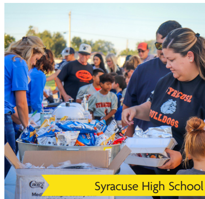
Syracuse High School