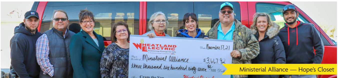
Ministerial Alliance — Hope's Closet