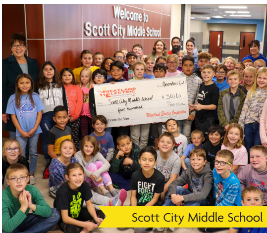
Scott City Middle School