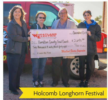
Holcomb Longhorn Festival