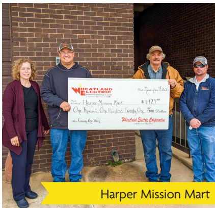
Harper Mission Mart