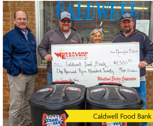
Caldwell Food Bank

Thank you to our communities and local schools for showing us "Yes, WE Can!" Cram the Van and helping us generate another record-breaking year!