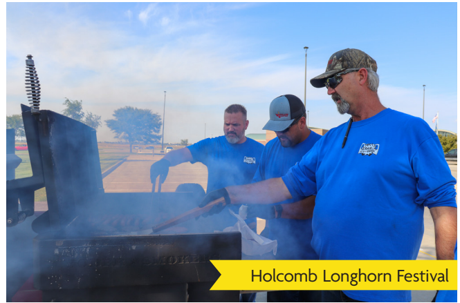
Holcomb Longhorn Festival