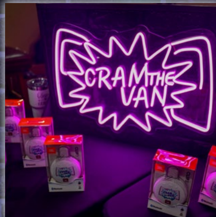
The tournament is our kick-off event for our Cram the Van food drive! Winners of this year's tournament received Cram the Van branded clip-on speakers.