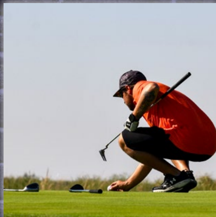
FORE a great cause! The annual charity tournament raised over a whopping $20,000 in proceeds!