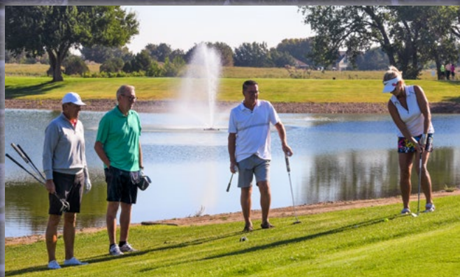
Tournament participants play during our Cram the Van kickoff event at the Golf Club at Southwind on Sept. 16, 2022.