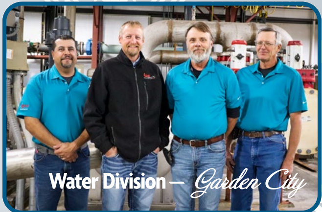
Water Division — Garden City