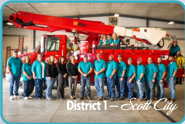
District 1 — Scott City

From our Wheatland Electric Cooperative family to yours, we hope you have a blessed and delightful holiday season.