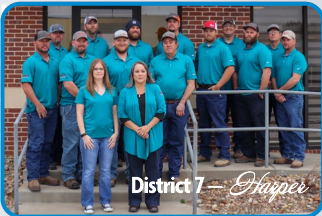
District 7 — Harper