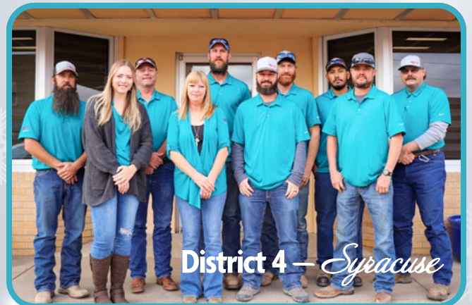
District 4 — Syracuse