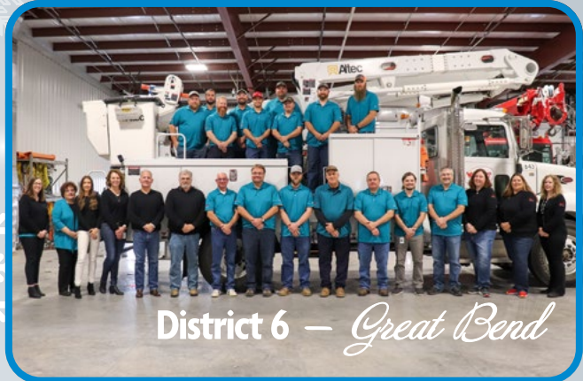
District 6 — Great Bend