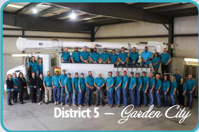
District 5 — Garden City

All WEC offices will be closed for the holidays on Dec. 23, Dec. 26 and Jan. 2.