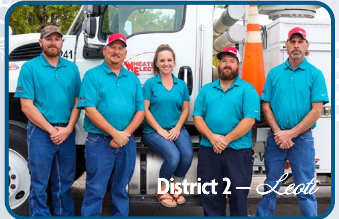
District 2 — Leoti