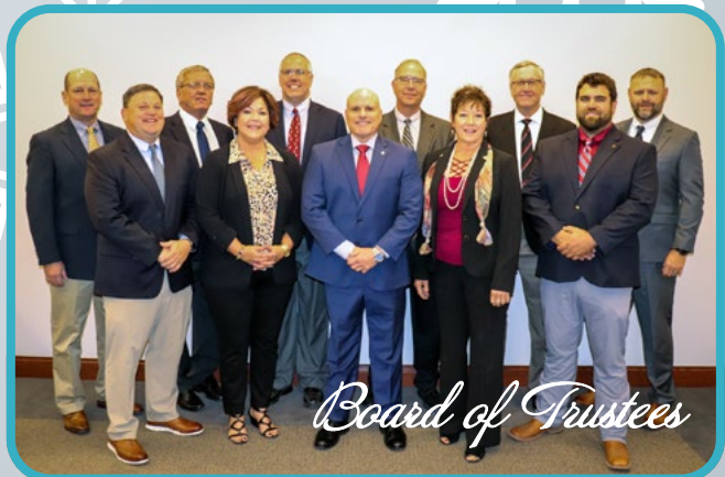
Board of Trustees