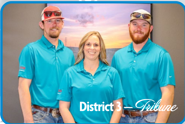
District 3 — Tribune