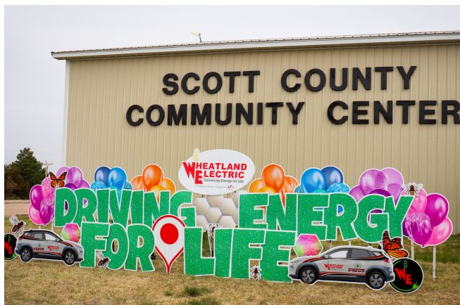
This year's annual meeting theme was "Driving Energy for Life," to reflect our new electric vehicle program and our cooperative's commitment to be future-focused.

This year's theme, "Driving Energy for Life,"