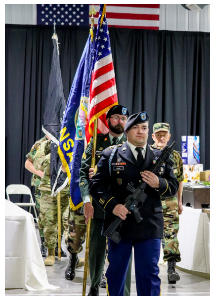
The colors were posted and retired by military color guards, which was livestreamed to seven additional remote meeting locations.

Members with questions are free to contact their local WEC office or send their questions to memberservices@weci.net .