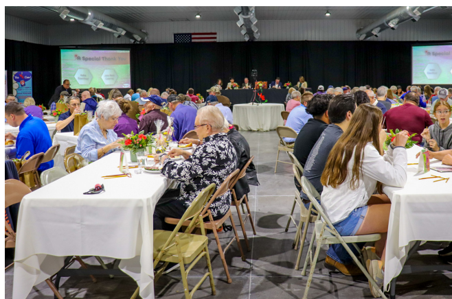
This year's annual meeting saw record attendance with a guest list of over 500 members and special guests across our eight meeting locations: Scott City (pictured above), Leoti, Tribune, Syracuse, Garden City, Great Bend, Harper and Caldwell.

Members with questions are free to contact their local WEC office or send their questions to memberservices@weci.net .