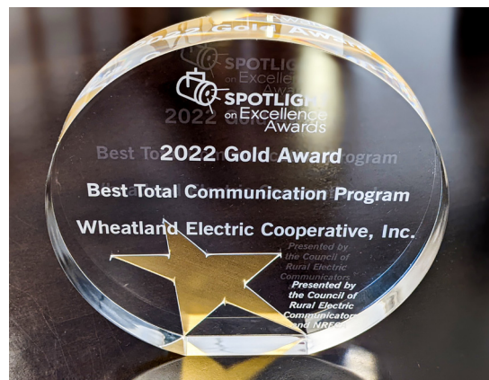
WEC's member services team received a Gold Award in the Best Total Communications Program category for our 2021 Cram the Van "Yes, WE Can!" food drive campaign.

The annual Spotlight on Excellence Awards program recognizes the best communication and marketing efforts by electric cooperatives and related organizations. Entrants competed with electric cooperatives of similar size in 18 categories with over 600 submissions made across the nation. Faculty members from the University of Missouri–Columbia and University of South Carolina, as well as noted professionals in the fields of marketing, web design and digital communications, and newspapers judged the event, which uses a finite scoring system to determine the winners.