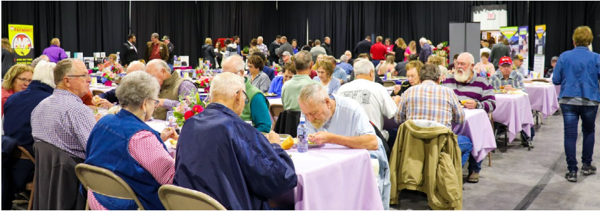
A record 814 individuals attended Wheatland Electric's 2023 Annual Meeting on April 26. The meeting was held in Scott City and seven other meeting locations in Leoti, Tribune, Syracuse, Garden City, Great Bend, Harper and Caldwell.

voted 320-287 to pass revisions to the cooperative's bylaws. These revisions include the following changes: