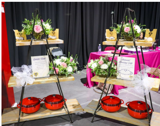
Attendees at this year's annual meeting received a Dutch oven and spoon rest, custom engraved by students from Wichita County High School, as a special 75th anniversary gift.

In addition to the election of trustees, members