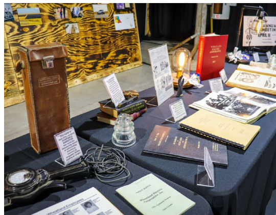
Historical items were on display in Scott City reflecting 75 years of shared cooperative history at WEC.