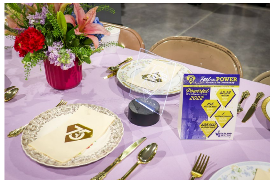
A table display commemorates WEC's 75th anniversary at the annual meeting in Scott City on April 26, 2023.