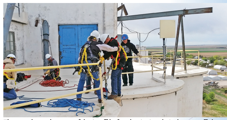
The crew learns how to safely tie off before beginning their descent off the Scott City Co-op elevator.

to a 170-foot tall tower owned by Wheatland Electric. The crew learned how to safely lower a conscious, but injured person, and finally a person who was unconscious, by attaching them to an able climber who could then bring the injured party safely to the ground.