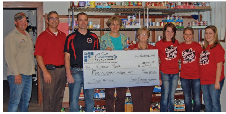
Mission Mart in Conway Springs received a $500 donation and 450 pounds of food from the "Cram the Van" food drive.

The drive featured a big red van, covered in bright "Cram the Van" decals, which Wheatland brought to various community events. Wheatland challenged you, our members, to help "Cram the Van" with non-perishable food items for the local food bank and