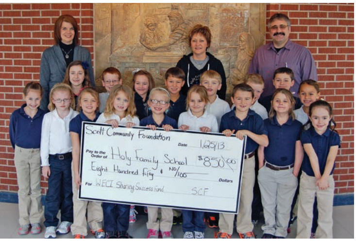
Wheatland's Sharing Success program gives $10,000 to local charities each year. Holy Family Schools was one of many recipients in 2013.