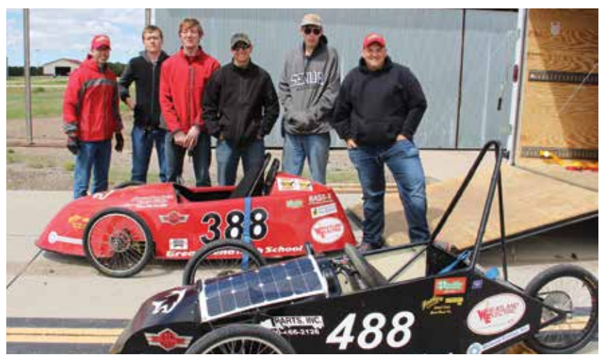
The Great Bend high school team prepares for the 19th Annual Sunflower ElectroRally.