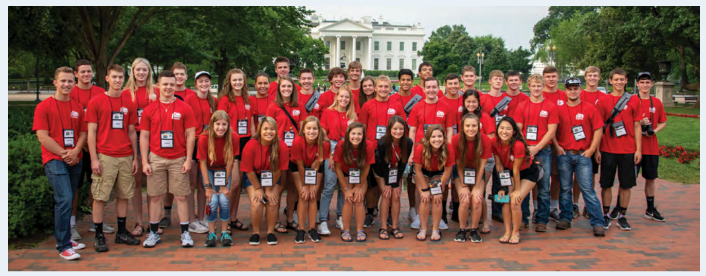
Thirty-nine delegates from Kansas and Hawaii stand in front of the White House during their tour of Washington, D.C., June 7-14.