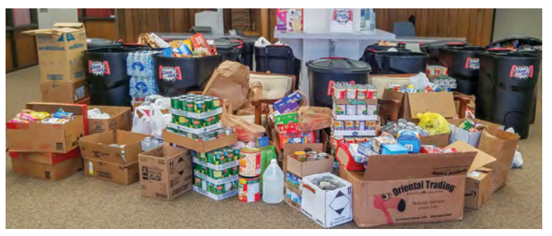
Donated food items from Cram the Van fill the Great Bend office. Donations are delivered to the local food bank in the community in which they were donated.

At the end of October, Wheatland will collect the donations and deliver them to the local food bank in the community in which they were donated. We've collected more than 21 tons of food over the last four years. Help us break last year's record of collecting nearly 10 tons!