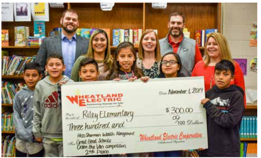
Riley Elementary School in Great Bend received second place in the Hiss-Sherman Wealth Management Group school challenge. Riley increased their 2019 donation amount by over 1,730 pounds compared to their 2018 total!

1,330 pounds of food to the Great Bend total. During the prior week, HISS- SHERMAN WEALTH MANAGEMENT GROUP sponsored a Great Bend school challenge raising nearly 8,000 pounds of food for the Community Food Bank of Barton County. This, coupled with the other donations in Great Bend, totaled nearly 10,300 pounds of food, an increase of over 75% from last year's total.