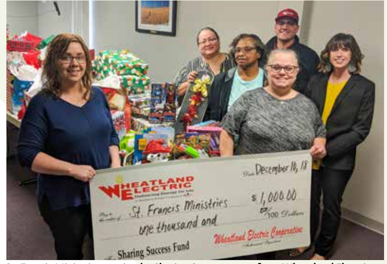
St. Francis Ministries received a Sharing Success grant from Wheatland Electric and CoBank in 2018.

also have international offices in Guatemala, Honduras, El Salvador, and Costa Rica, where they focus on empowerment and entrepreneurship.