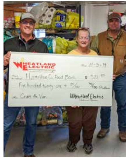
Syracuse more than doubled their donations from the previous year by collecting 842 lbs. of food for the Hamilton Co. Food Bank. Way to go, Syracuse!

Scott City wrapped up the FIRST NATIONAL BANK SCHOOL CHALLENGE Oct. 17 and celebrated with hotdogs and hamburgers at the Scott City Middle School football game. Scott City Middle School claimed the $500 school competition prize. Collectively, the school competition and football game generated over 1,820 pounds of donations for Hope's Closet.