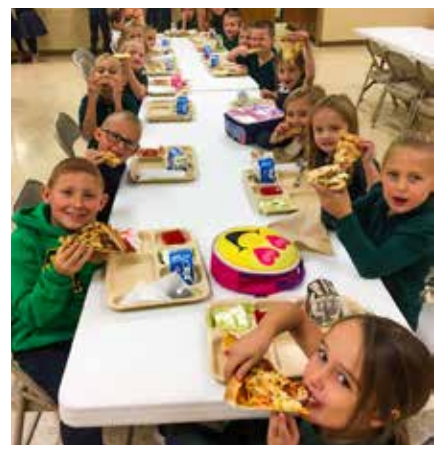
Students at St. Joseph Catholic School in Conway Springs enjoy their pizza party for collecting over 800 items for Mission Mart.

On Oct. 18, the Wheatland team hosted Cram the Van events in both Great Bend and Conway Springs. Great Bend hosted an office lunch and later a tailgate at the Great Bend High School football game. These events added over