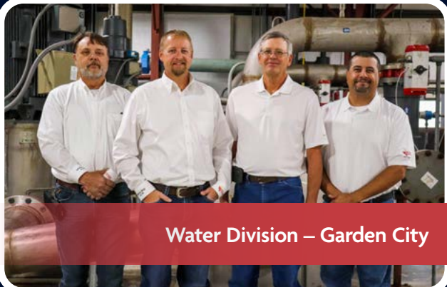
Water Division – Garden City