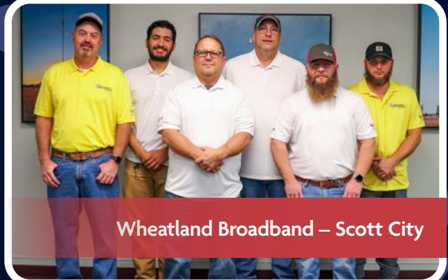
Wheatland Broadband – Scott City