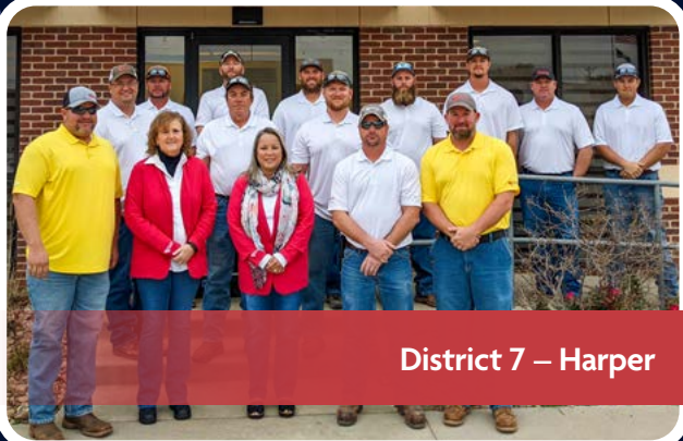
District 7 – Harper