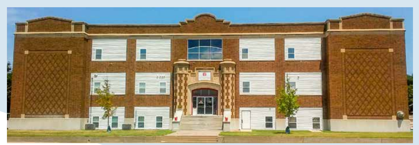
The Central Kansas Dream Center building, located at 2100 Broadway Avenue in Great Bend.