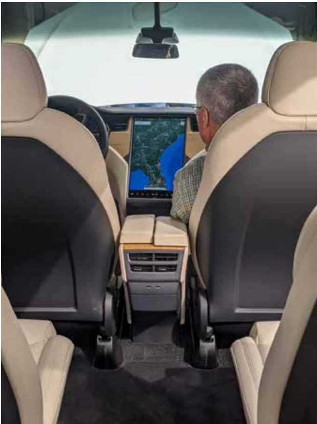
During the conference, attendees had the opportunity to get a better understanding of how electric vehicles work.

Staying up-to-date with industry technology trends is vital for the future of Wheatland Electric Cooperative. Knowing where to invest in the future of the cooperative is not only beneficial for our current membership, but also in gaining insight into national trends that are valuable for attracting new businesses and members to our communities.