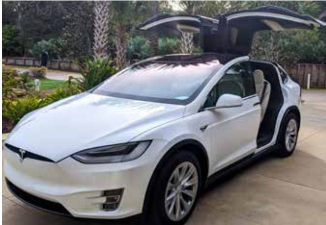
Tesla’s SUV model X was on display and available for test drives.

“We have had several members ask about solar in recent years, and our operations team has been great