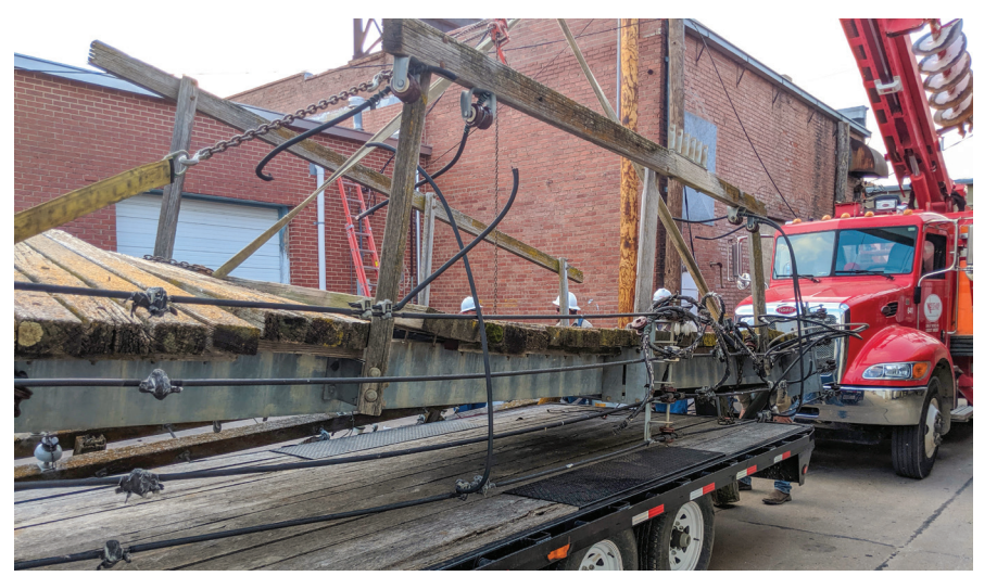
One of the old platforms that a transformer sat on is ready to be hauled away.

At the end of May, our Great Bend crew conducted two, night outages behind the historic Crest Theatre. The