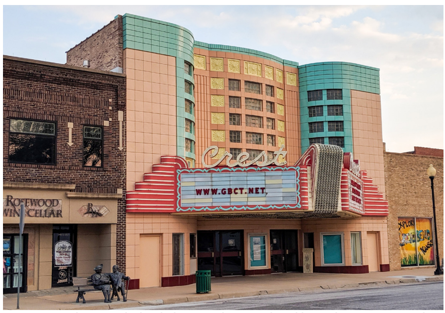
Our Great Bend crew worked with the Crest Theatre and neighboring businesses to conduct two separate night outages.

A "night outage" or "after-hours outage"