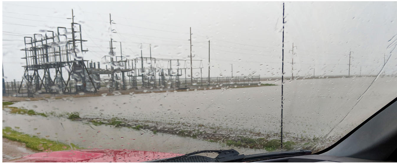
Great Bend crews look toward the Wheatland substation northwest of Great Bend after heavy rains fell in the area.

An unusually wet spring has taken its toll on many residents across several Midwestern states, and Wheatland Electric Cooperative's service territory is no exception. Linemen in a few of our territories have been hit especially hard in May with the significant increase in precipitation and spring storms.