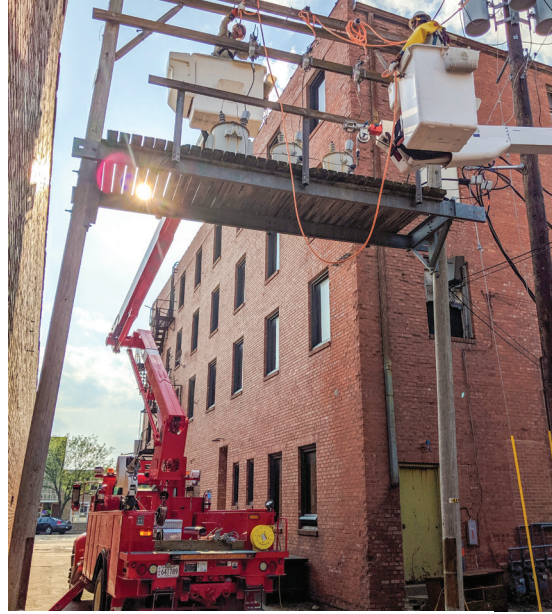
An older platform and transformers were removed from the alley behind the Crest Theatre in Great Bend during a night outage on May 30.

new HVAC system at the Crest required an increased energy load, so our crews replaced the three older transformers that powered more than a block and a half of businesses in downtown Great Bend. The businesses relying on these three older transformers were then divided into four groups and each group was allocated to one of four new sources of power.